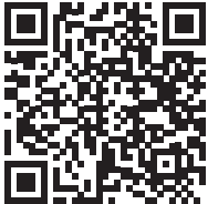
SunStat® CommandPlus™ Wi-Fi Programmable Touchscreen Thermostat