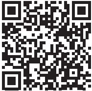
ProMelt® Smart Panel 400201 UPC: 840213022648 Ordering Code: 8101022 ProMelt Subpanel 200A, No Controller